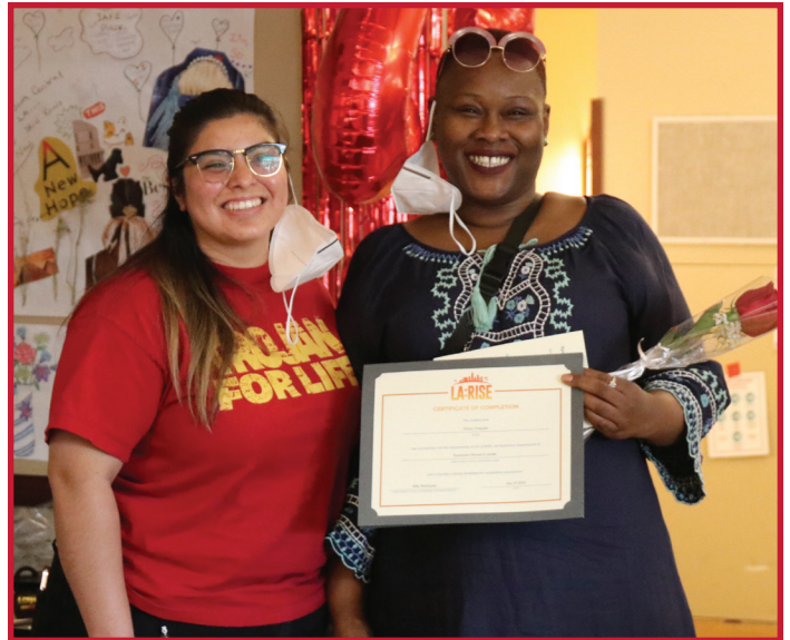
Graduates of the LA:RISE program are celebrated at an annual graduation ceremony. LA:RISE participants complete 300 hours of transitional job training at DWC and our social enterprise MADE by DWC.